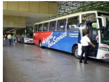
Fig 2: Buses line at airport sidewalk Wing D