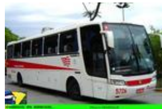
Fig 3: Bus that makes the transportation to São José dos Campos from airport.

Time table: 07:00, 08:30, 10:00, 11:30, 13:30, 15:00, 16:30, 17:30, 18:30, 20:00, 22:00